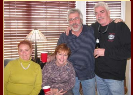
Redheads always seem to have men hovering nearby.....